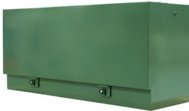
Standard 66" wide SecTER cabinet