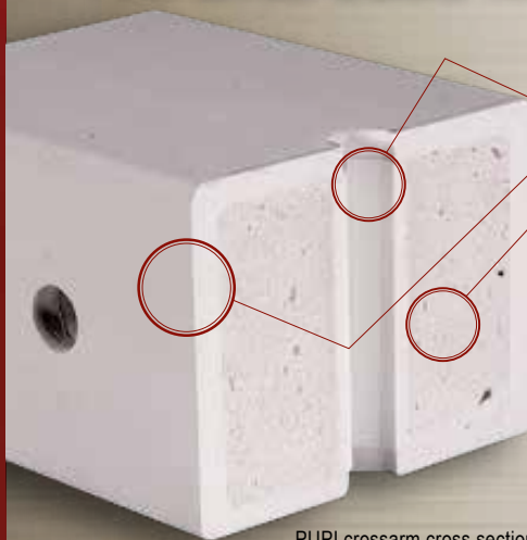
PUPI crossarm cross section